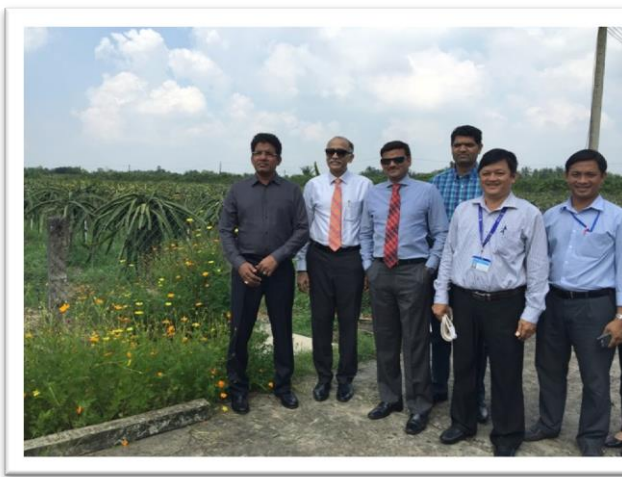
Visiting SOFRI's Dragon Fruit Experiment Garden