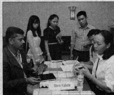
Representatives of Indian and Vietnamese firms exchange information at a business interaction event in HCM City on Wednesday.

Organised by the India consulate, the event attracted the participation of a 15-member del-