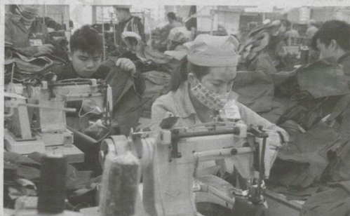
Workers at the central Quảng Trị Province-based Hòa Thọ Đông Hà Garment Co make garment products for exports.

Also, under the India-ASEAN FTA, most types of cotton yarns, woven cotton