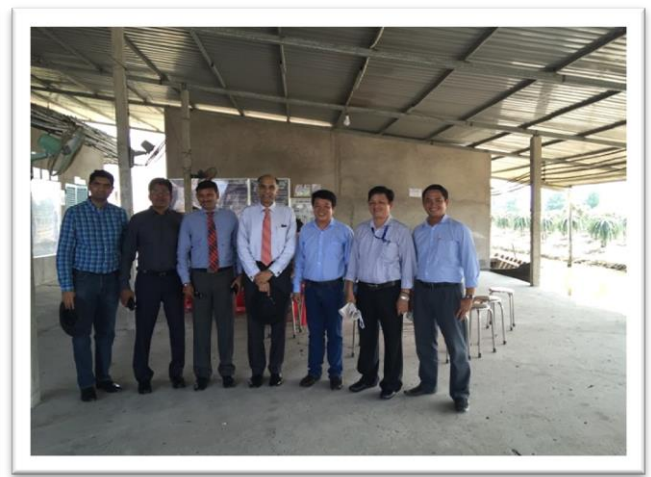
Visiting Cat Tuong Agricultural Processing and Production Co. Ltd, My Tho City