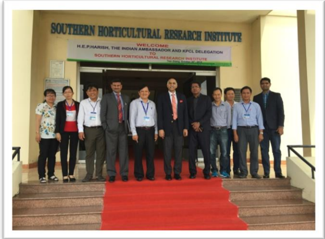
Ambassador, delegation from Krishnapatnam Port Company Limited and SOFRI's officials