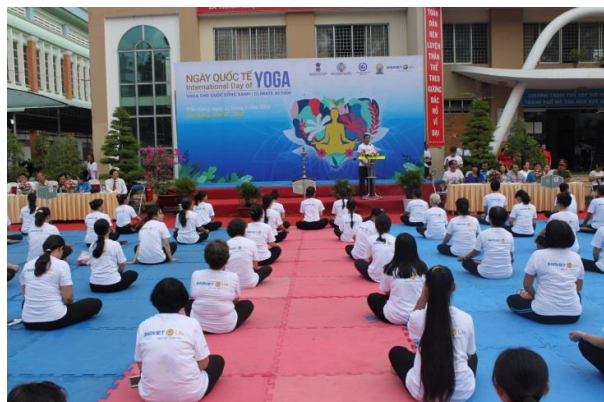
Tien Giang Province (21 June)