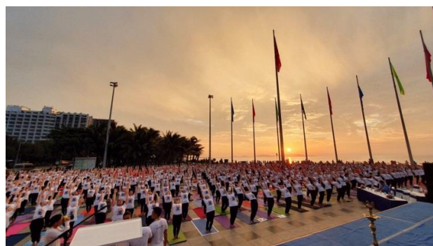
Ba Ria – Vung Tau Province (06 July)