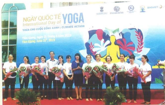
Đại biểu tặng hoa cho đại diện các CLB Yoga

“Ngày Quốc tế Yoga” năm 2019 là sự kiện có ý nghĩa không chỉ với cộng đồng Yoga mà còn đại diện cho một tinh thần sống xanh, sống lành động và sống có trách nhiệm của người Việt trong cuộc sống hiện đại. Năm 2019, Ban tổ chức chương trình mong muốn lan tỏa thông điệp: Một hành động nhỏ cũng có thể mang lại những thay đổi lớn, một tâm hồn đẹp đi cùng với những hành động đẹp.