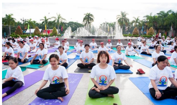
Soc Trang Province (23 June)