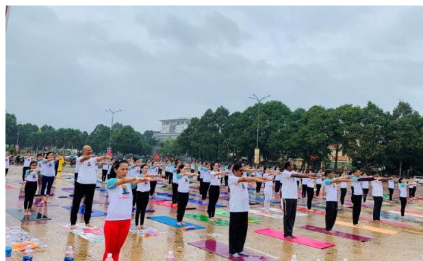
Dak Lak Province (16 June)