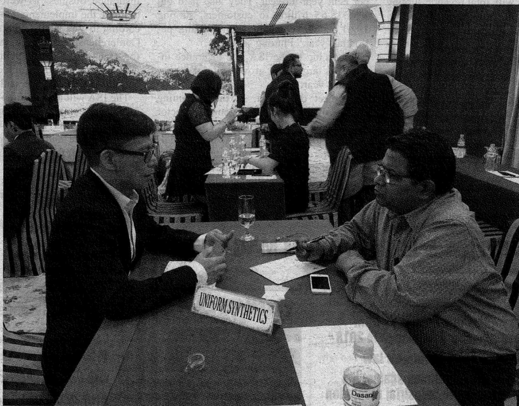
Executives of Vietnamese and Indian companies exchange information at the India-Viet Nam business matching held in HCM City on Thursday.