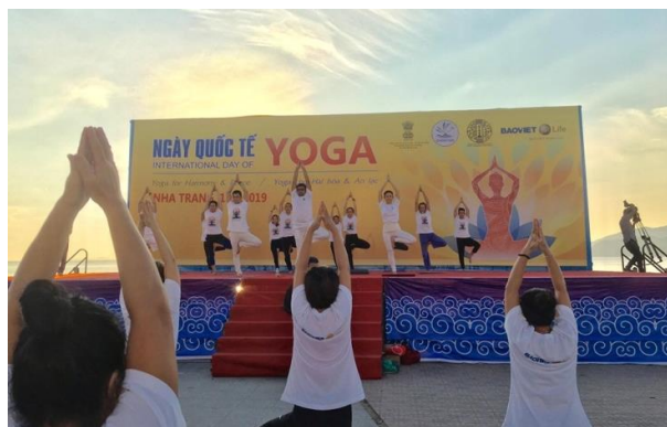
Khanh Hoa Province (15 June)