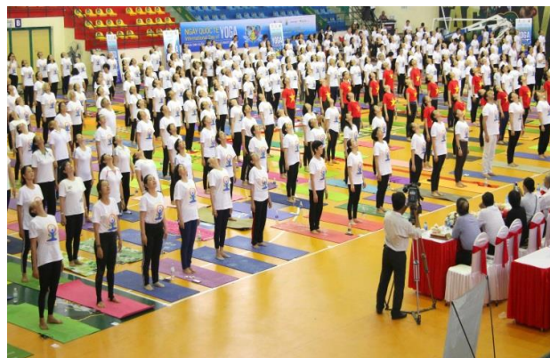
Can Tho City (22 June)