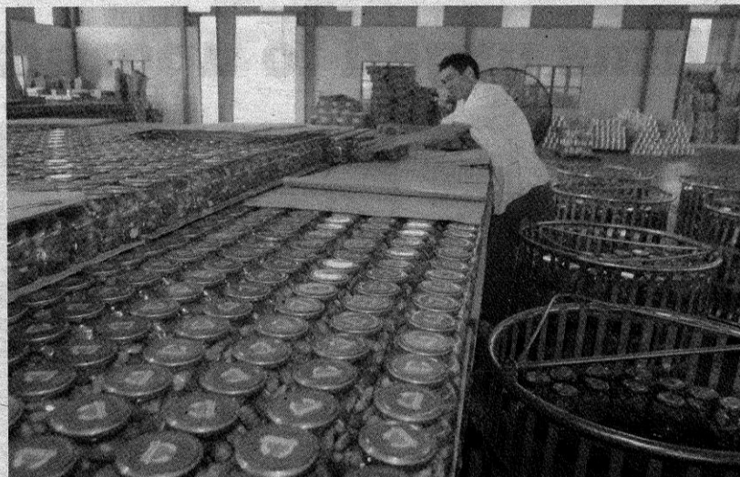
A worker checks canned cucumbers at the VIFOCO Import Export JSC in the northern province of Bắc Giang. The company's products are exported to India.

The CII is also planning to open an office in HCM City to facilitate investment by Indian companies, he said.